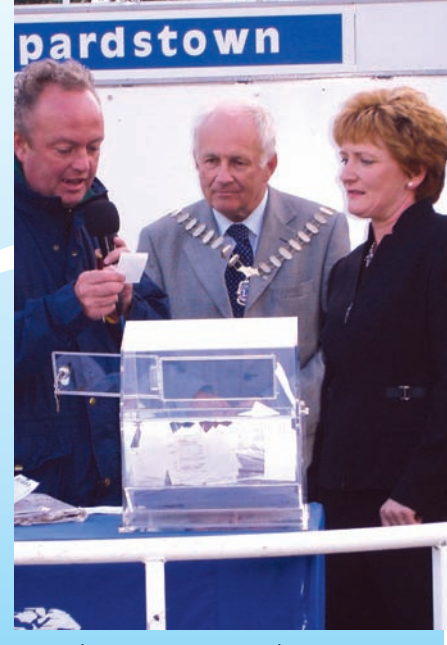
Leopardstown Lions Race Night 2006